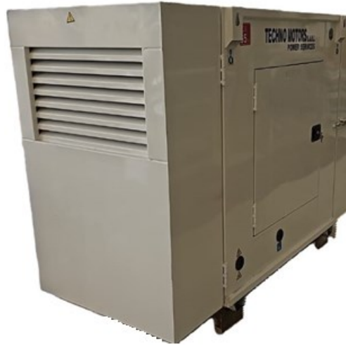
TMS015 65 dBA @ 1 Meter

All of the Generating Sets are covered under a warranty policy for a period of 12 months or One Thousand Hours Run Time (1000hrs.). Warranty of the equipment is in line with manufacturers warranty terms & conditions.