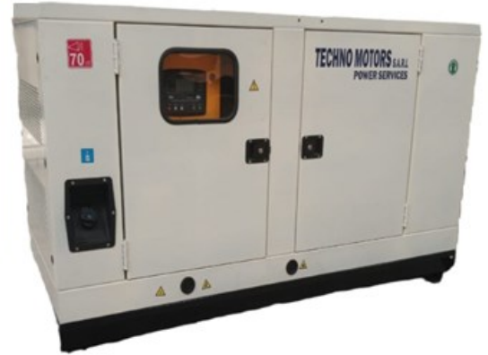
TMS015 75 dBA @ 3 Meters